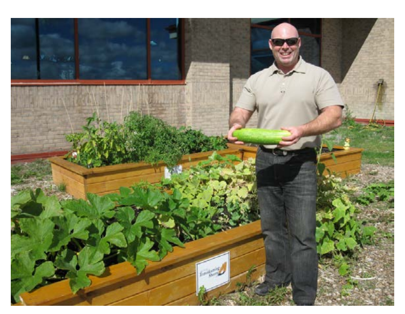
Picture 9: Community garden by the City of Temiskaming Shores Fitness Centre

There are six small plots of land provided by the City for community members to use as community gardens, and there is an Economic Development Coordinator who provides assistance (e.g. connecting individuals with potential buyers, providing information on government funding programs) for individuals who are interested in championing local food initiatives, such as community-supported agriculture, <sup>123</sup> For smaller municipalities, it can be very effective to provide a point of contact for local food and agriculturerelated matters, as it empowers community members to champion their own projects. Also, the point of contact can express the municipality's interest and willingness to provide assistance in local food activities through chamber of commerce meetings, health unit meetings, and other community organization meetings.