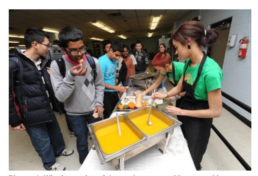
Picture 4: Winning recipe of the student competition served in Glenforest Secondary School

The key success factor for this initiative was to actively engage the stakeholders, including students and staff. For example, a competition was held for students to create menu items featuring local ingredients, and the winning items were to be served in 32 Peel cafeterias by Chartwells. 110 Also, local ingredients used in the menu items are displayed and marked with a special logo for students to easily identify local items. These strategies increased the level of support for the initiative from the students, and also provided a foundation for the students to become engaged in local food initiatives outside of the school context in the future.